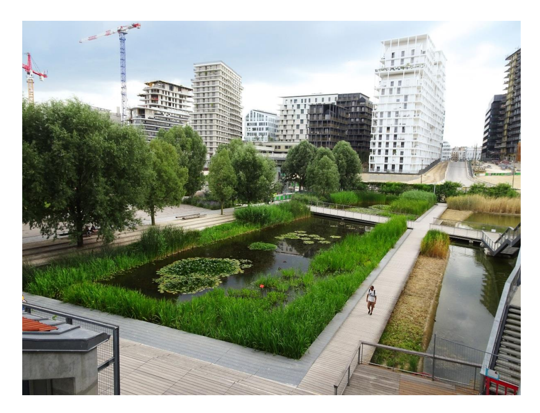
Figure 4. "Biotope" basin number 2 in Clichy-Batignolles, Paris.

The project was awarded a prize for environmental excellence by the Environment and Energy Management Agency (ADEME for its acronym in French) in the "Adaptation to climate change & regional development" category in January 2017 as well as the Construction 21 Network Sustainable City Grand Prize in November, 2016. For the purposes of this paper, it is used as an example of best practices for promoting the turquoise agenda. The risks that the Clichy-Batignolles project needed to take into account for the Parisian context included extreme heat waves as well as intense rain and drought (the temperature in Paris is usually 2.5 degrees Celsius hotter than in surrounding rural areas, going up to 8.5 degrees warmer in extreme heat waves). The report published by ADEME called "Taking climate change into account in an urban development project: the ÉcoQuartier of Clichy-Batignolles," describes some of Paris' vulnerabilities that came to light in an in-depth diagnosis performed in 2011-2013. These included increased risks of flooding and saturation of the sewer network as well as the potential scarcity of water, energy and food resources.<sup>6</sup> The city has made the ambitious choice to rely on the ecosystem services provided by the site to cool down urban spaces, cool down buildings, and optimize water management and to integrate the principle of sponge cities (Secchi & Viganò, 2011). In doing so, it makes the neighbourhood more resilient to flooding.