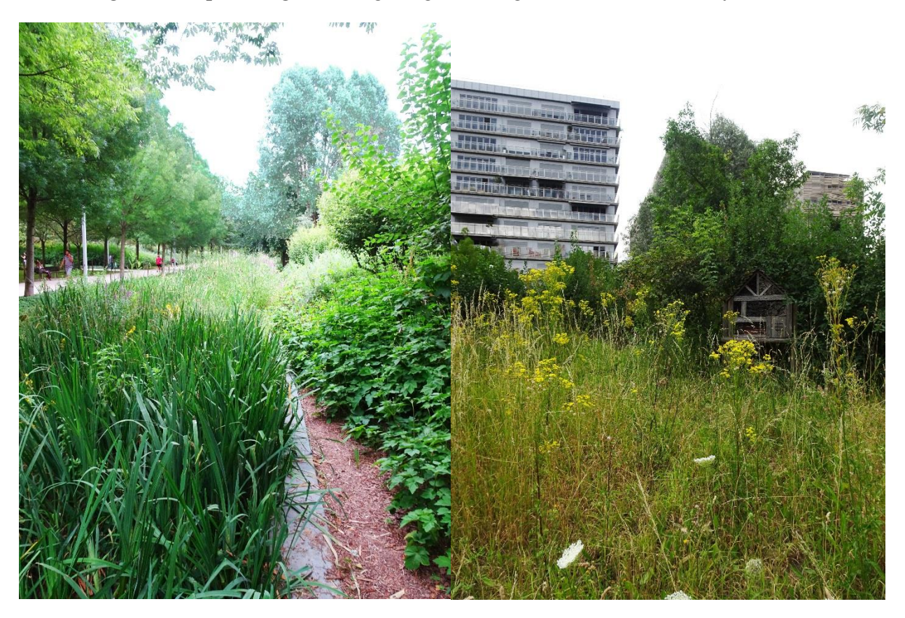
Figure 5. Shaded area and green corridor in Clichy-Batignolles' park in Paris. Source: Gascon, 2018. Figure 6. Wild vegetation and tree-house in Clichy-Batignolles écoquartier's biodiversity reserve in Paris. Source: Gascon, 2018.