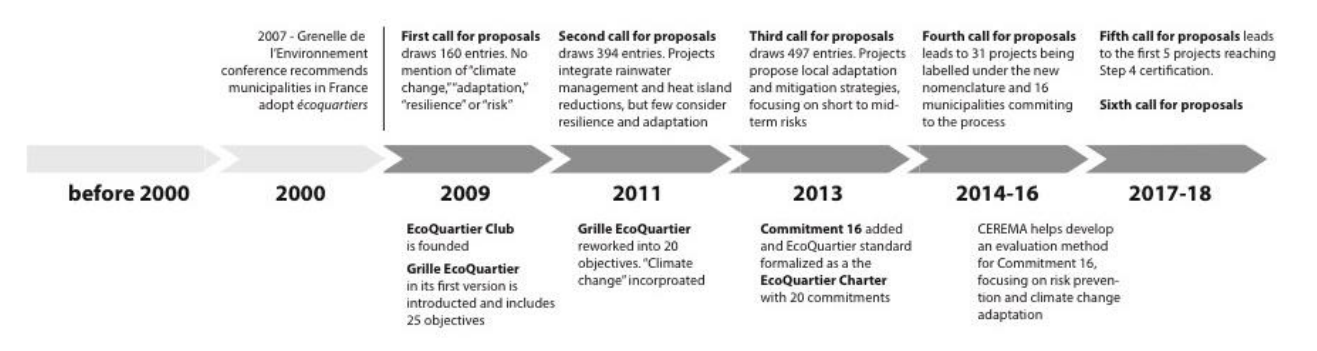
Figure 1. Evolution of the concept of ÉcoQuartier since 2009.

The ÉcoQuartier standard – a standard developed iteratively and in several different "generations".