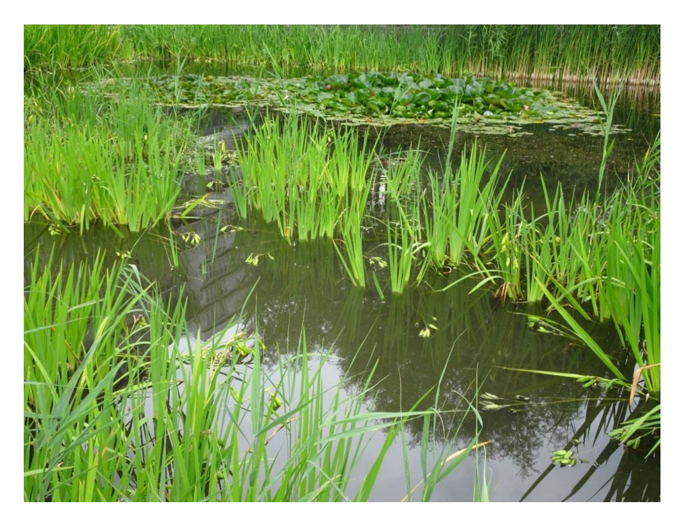
Figure 3. "Biotope" basin in Clichy-Batignolles écoquartier in Paris. © 2019 ISTE OpenScience – Published by ISTE Ltd. London, UK – openscience.fr Page | 7