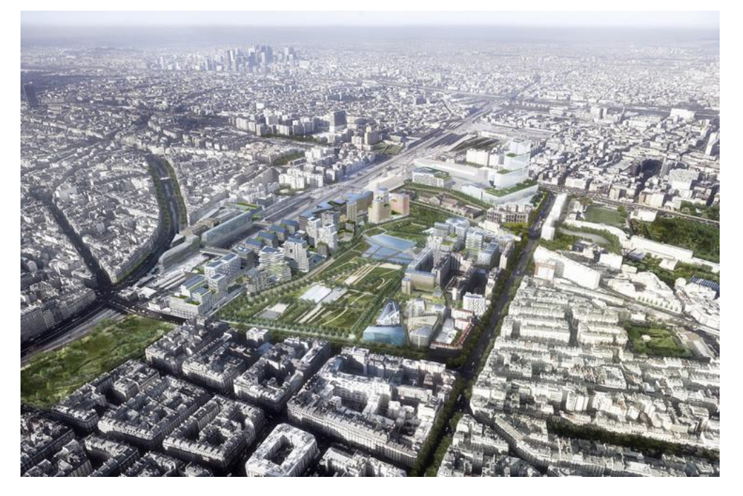
Figure 2. Aerial plan. Source: http://www.clichy-batignolles.fr/ © Vectuel-Studiosezz-PBA

- And on the social sustainability front, the project includes 3400 dwellings of which 50% will be social housing, 30% owner housing and 20% capped-rent housing