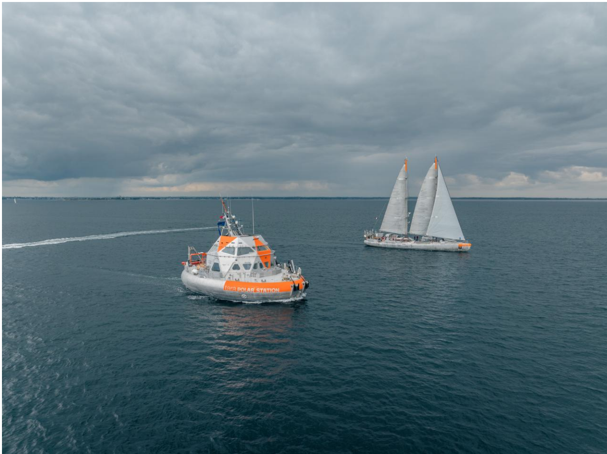
The vessels of the Tara Ocean Foundation.