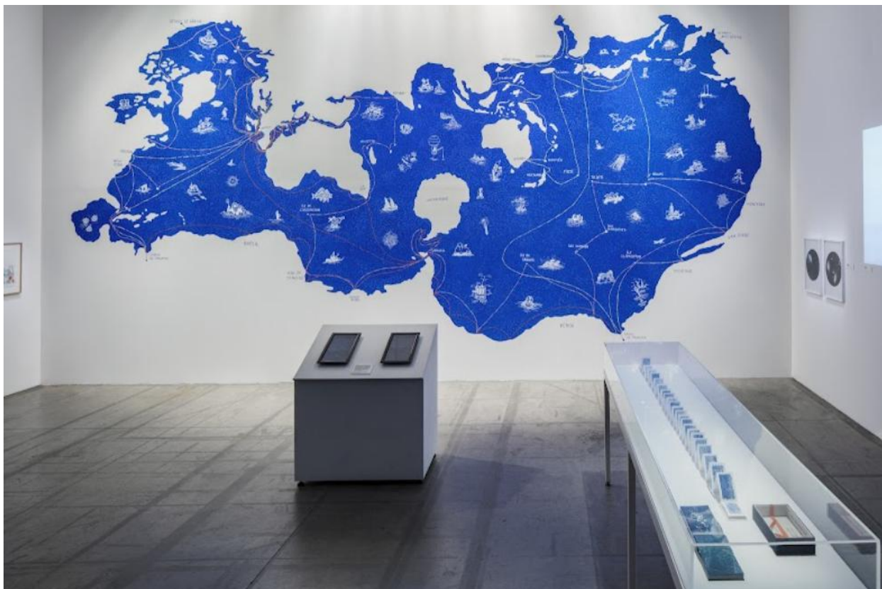
Part of the representation of the Ocean and the expeditions of the schooner Tara as seen by the artists collective Ensaders.

To reach broader audiences, the Tara Ocean Foundation is bringing these artistic visions to venues across many regions, making the ocean's story accessible to all.