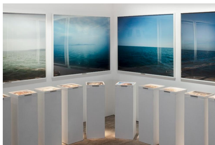
Les larmes de sirènes – Samuel Bollendorf offers a dialogue between the beauty of seascapes and the sad reality of samples taken on site.