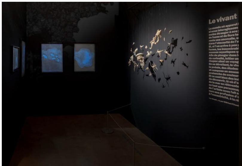
Left: Heliogravures - Aurore de la Morinerie Right: Un monde sculptural - Cécile Fouillade – SIQOU.