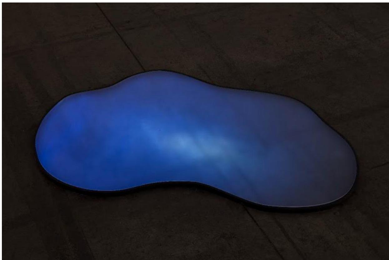
Conversation métabolite by Antoine Bertin.

MOTS-CLÉS. Artistes, résidences, science, diffusion du savoir, oceans/ pollutions, Fondation Tara.