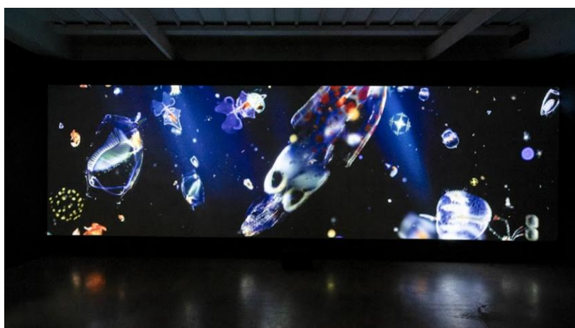
Plankton Ballet – Christian Sardet & The Macronauts.