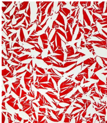
Simon Hantaï, Étude, 1969, oil on canvas, 275 x 238 cm. Washington, National Gallery of Art.

Simon Hantaï does it with the canvas itself: he crumples the cloth, dips it in the painting, then stretches and spreads it. Each white spot has the same thickness as the colored spots.