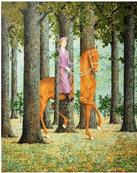
René Magritte, Le blanc-seing, 81,3 × 65,1, oil on canvas, 1965. Washington, National Gallery of Art.

In those shades of white of Caciagli's photos, the composition creates a crease of matter.