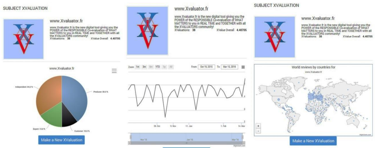
Figure 1: Examples of Personalized results integrating the alterity on Xvaluator tools: “Xvaluator s Typologies”; “Meteo of the Perceived Value of a subject”, “Volunteer Localisation of Xvaluator s”

As generic technology the Xvaluator QuAI acts as an integrative solution by applying democratic weighting (XVA 19) to the diverse and evolving expressions of human critical thinking with the power to personalize the tools and results based on “included third” approaches [LUP 87], [PLO 18].